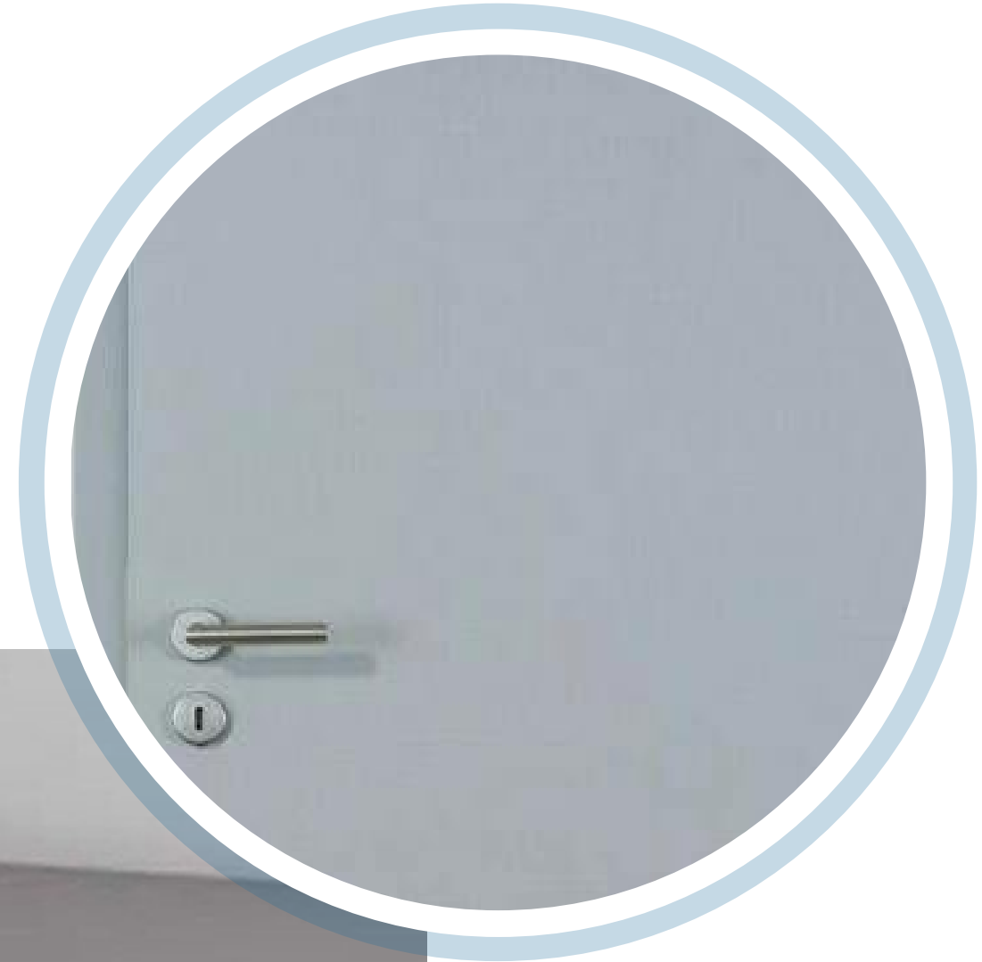
FIREPROOF ENTRANCE DOORS